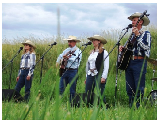
Saddle Strings will provide entertainment during the 3 rd Annual 4-H BBQ Supper & Concert. Saturday, August 27 at 5:30 p.m. at Sandridge Park in Roy.