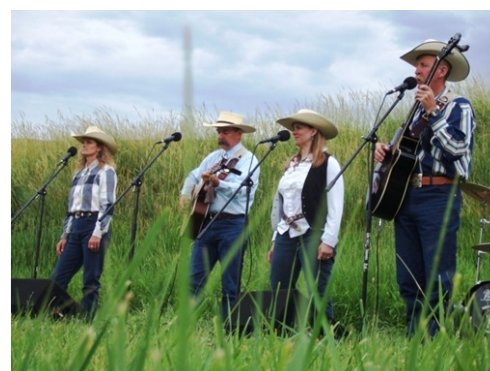
Saddle Strings will provide entertainment during the 3 rd Annual 4-H BBQ Supper & Concert. Saturday, August 27 at 5:30 p.m. at Sandridge Park in Roy.